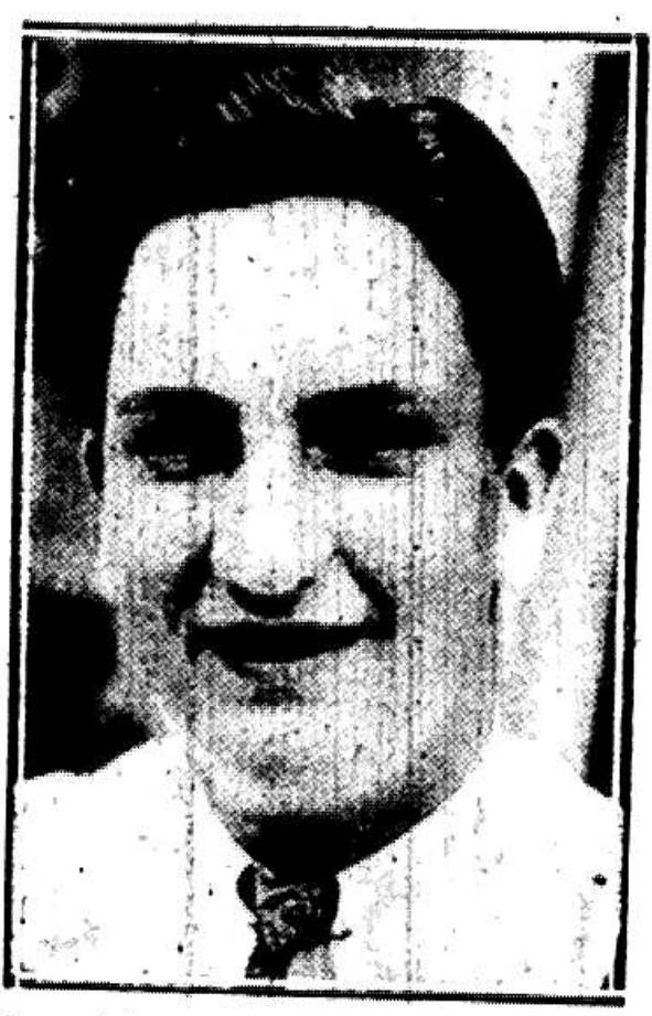
One of Metacomet's Hopefuls for R. I. Amateur Golf Crown. He's Only 17 Years Old.

Island professional, made a small set of clubs for him.