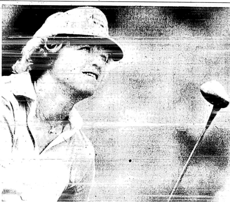
EAGLE-EYED: JoAnne Carner, two-time titlist in tourney, follows drive in practice round at Salem