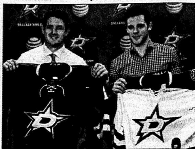
Newest Stars Shawn Horcoff, left, and former Bruin Tyler Seguin are introduced at a news conference in Dallas on Tuesday.