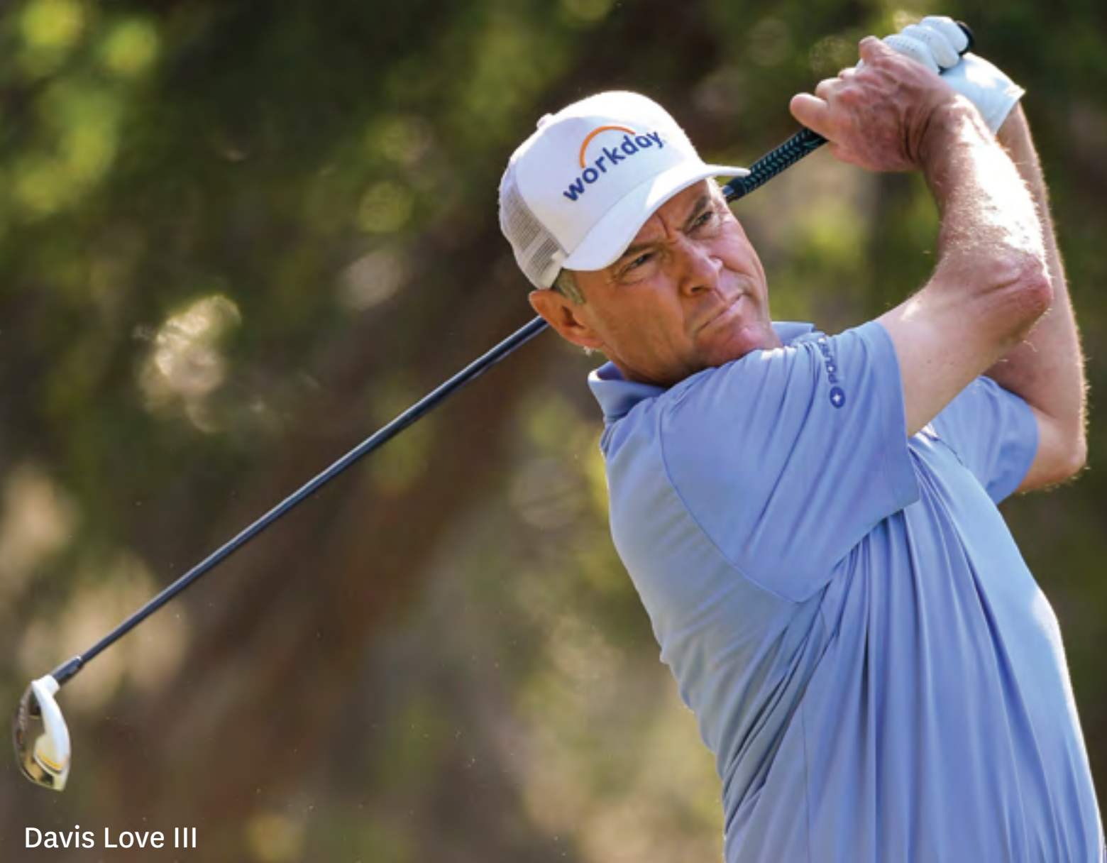
Davis Love III