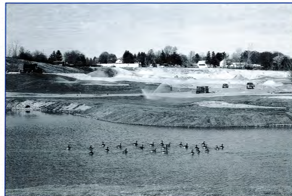
Button Hole under construction in early November

'It's no secret that the USGA is behind Button Hole; they've made two grants totalling $100,000.'